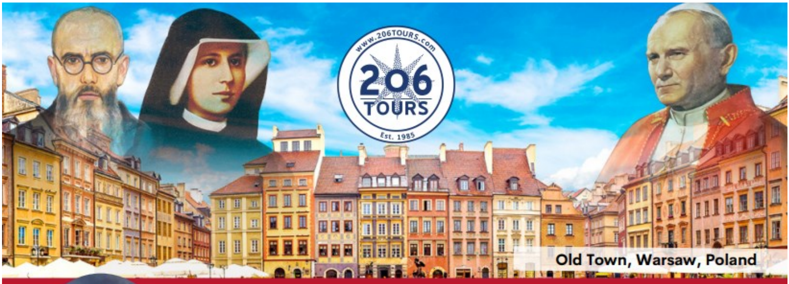
Old Town, Warsaw, Poland