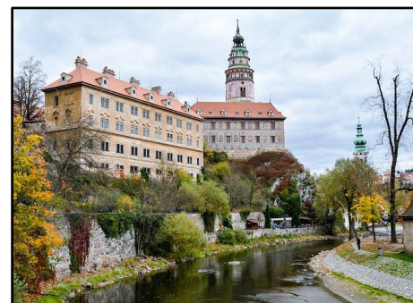
Cesky Krumlov, Bohemia

Join Syversen Touring on a once-in-a-lifetime pilgrimage to Oberammergau, home of the Passion Play, with visits to Altotting, Munich, Hohenswangau, Salzburg, Cesky Krumlov and Prague!