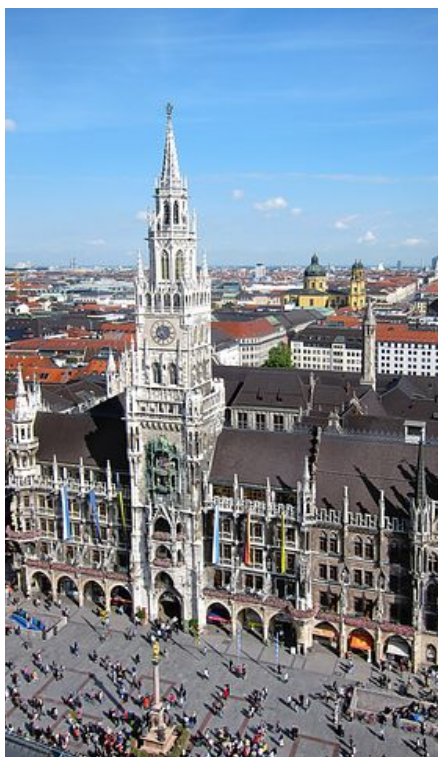
Marienplatz in Munich