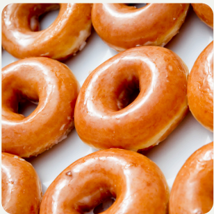
Treats Tent October Shannon Woods Fall Friendlies

Meet our players in the community volunteering in a variety of events and activities.