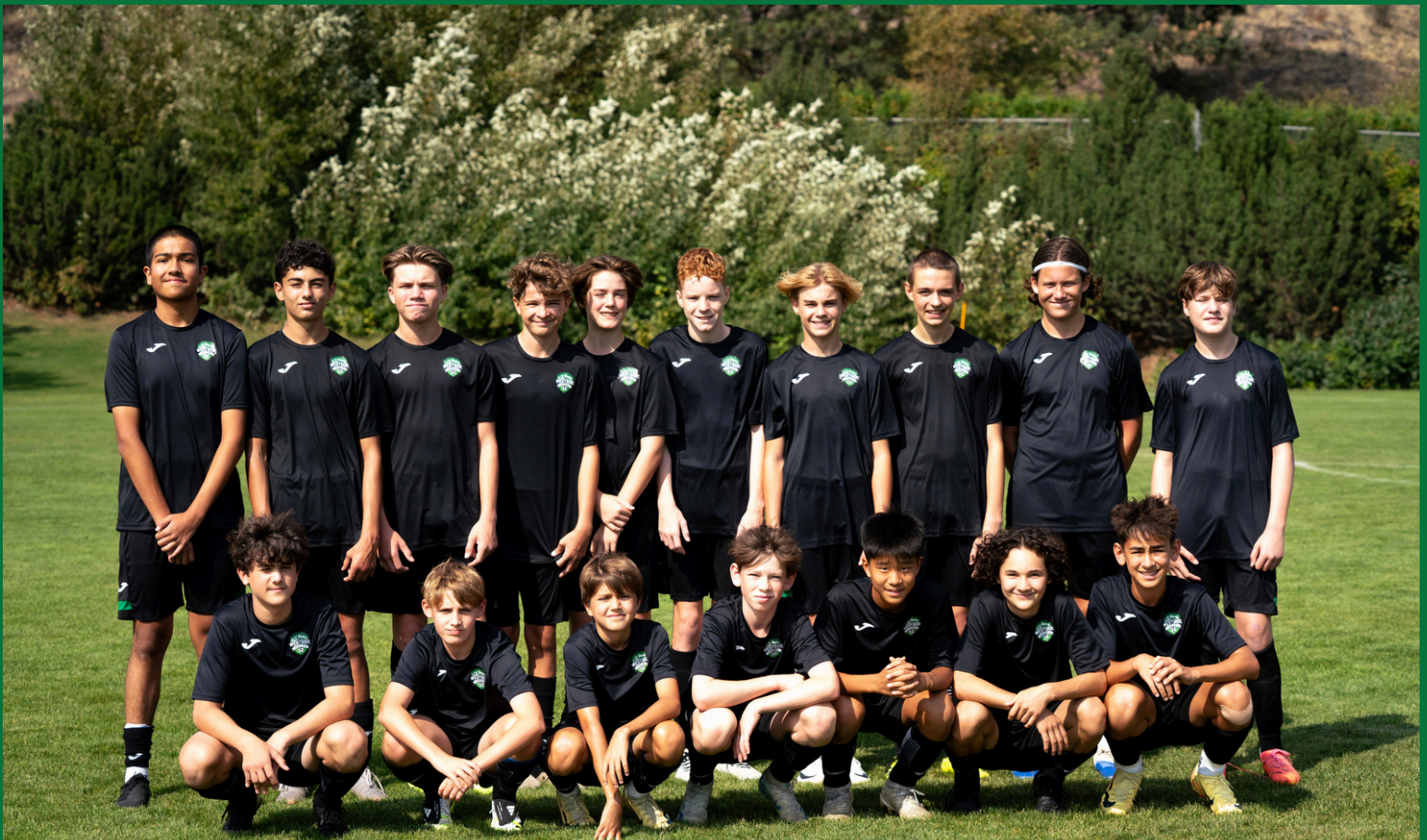
Westside Lakers England Tour 2026

Help our players write a story of success that starts here, with your support, and reaches across the ocean.