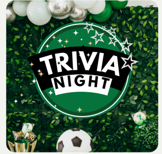
Trivia Night January Raffle prizes & tickets by donation.