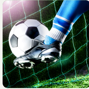
Kick for a Cause December Games, skills, coaching & prizes