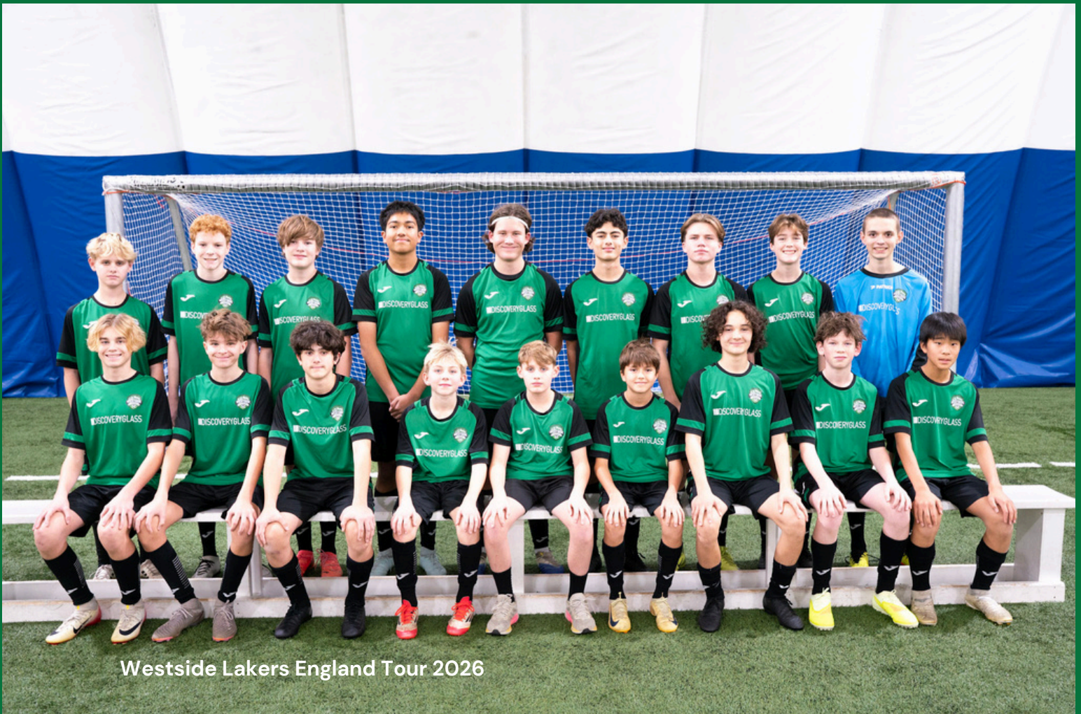
Westside Lakers England Tour 2026

Help our players write a story of success that starts here, with your support, and reaches across the ocean.