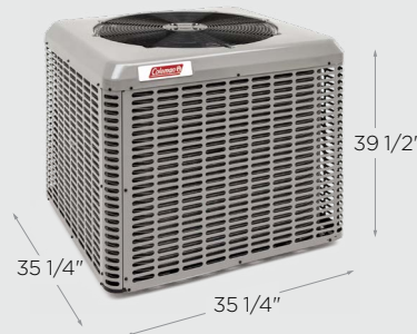
Traditional heat pump