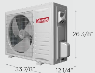
HMH7 modulating heat pump