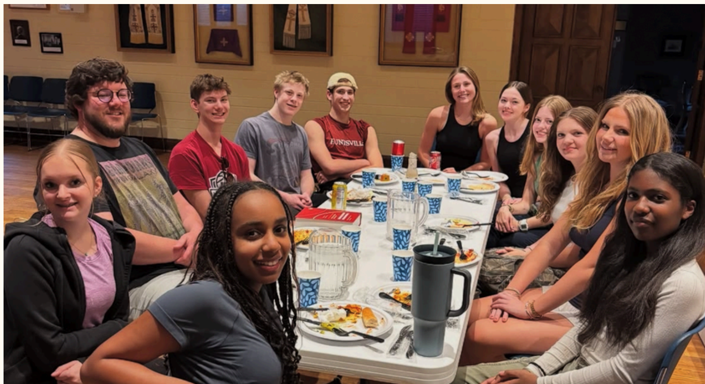
Oh! The Pastabilities!