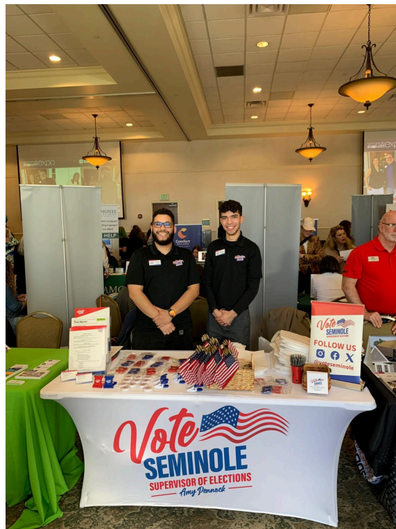
The Seminole Business Expo Hosted by the Seminole County Chamber

Please note that the Seminole County Supervisor of Elections office will be closed on Monday, February 16, in observance of Presidents' Day. We will reopen during regular business hours the following day.