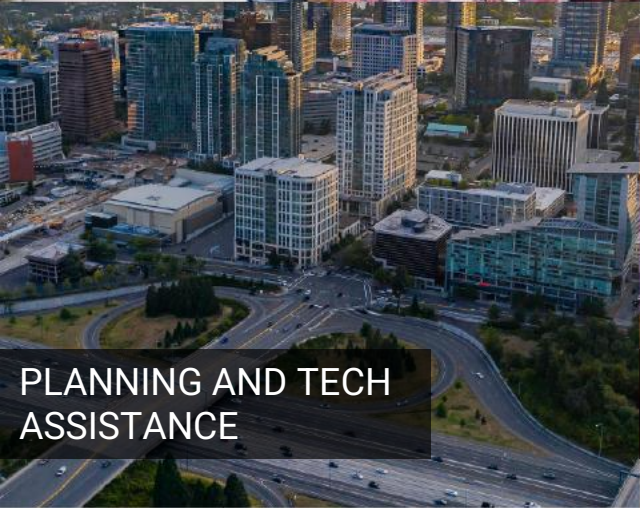
PLANNING AND TECH ASSISTANCE