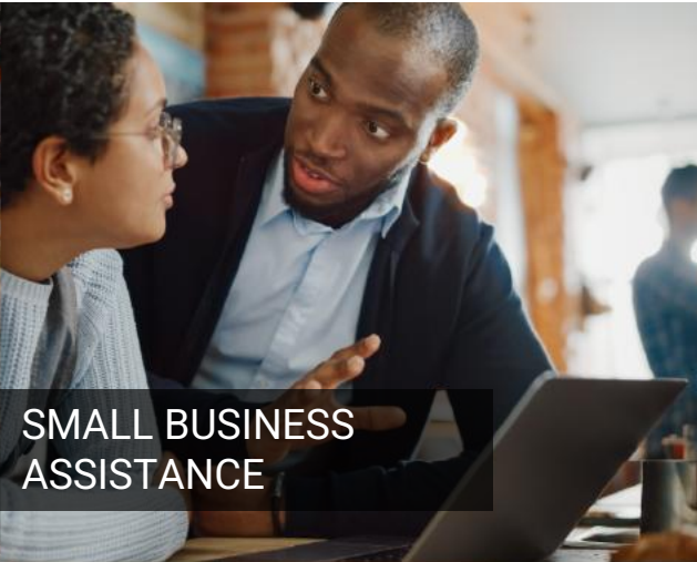
SMALL BUSINESS ASSISTANCE