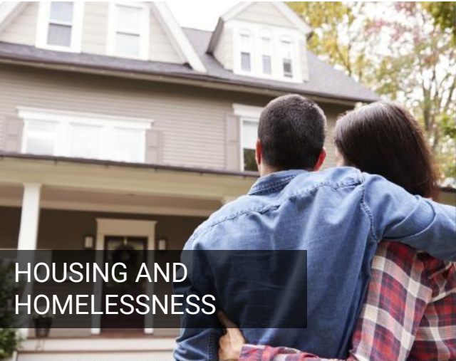
HOUSING AND HOMELESSNESS