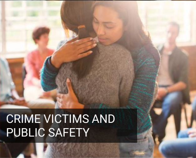
CRIME VICTIMS AND PUBLIC SAFETY