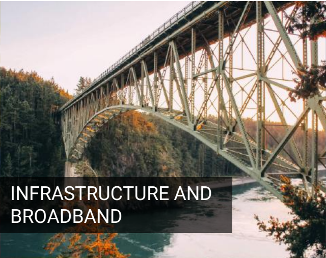
INFRASTRUCTURE AND BROADBAND