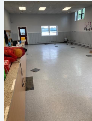
Games room floor!

Our games room now has a spectacular view! Thanks to a $30,000 grant from the JoAnn DeNapoli Foundation the Club upgraded four windows and installed new flooring. The natural light from the expanded windows is phenomenal and, together with the new light gray flooring, makes the room look so much bigger and brighter. Our members enjoy the breezes off of the pond and the view of all of the wildlife in and around the pond. We are so grateful to our friends at the JoAnn DeNapoli Foundation for their continued partnership with the Club.