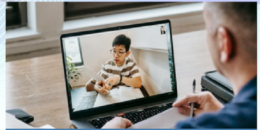
INDIVIDUAL MENTORING (REMOTE)

Having achieved so much in 2023-2024, we now have a clear path for Impactful Lives to work with Impactful Governance to deliver more projects during 2024-25 focused on: