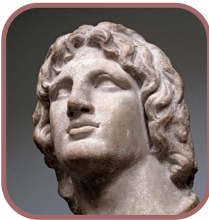
Alexander the Great