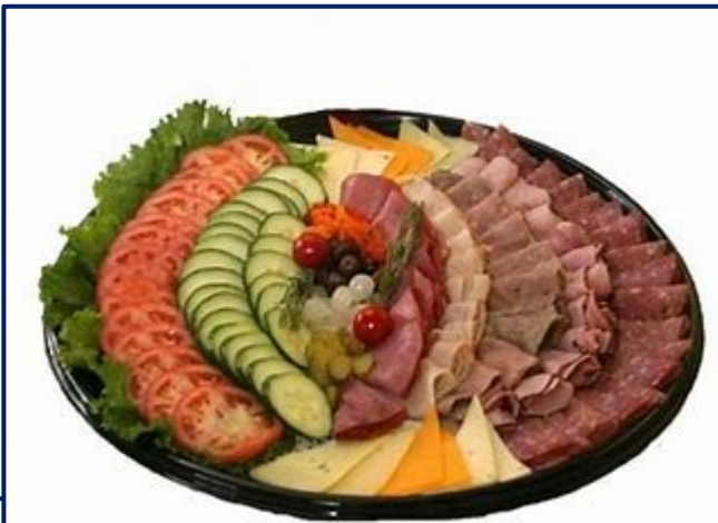
Borrowed from lunchmeat tray