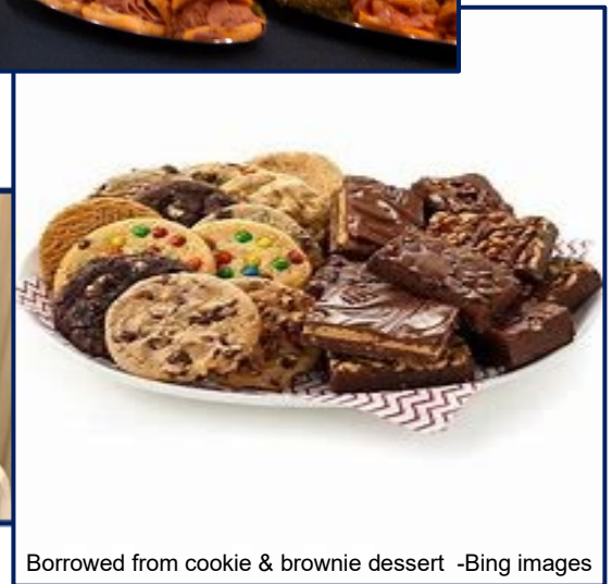
Borrowed from cookie & brownie dessert -Bing images