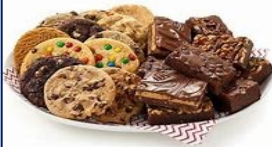
Borrowed from cookie & brownie dessert -Bing images