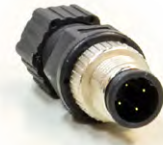
For FE UTP