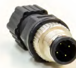
For FE UTP