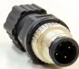
For FE UTP