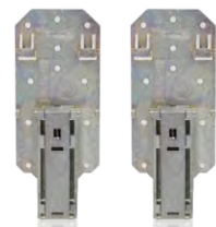
(130 X52mm / 4 Screws) (2pcs/set)