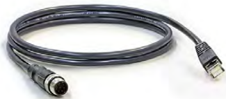
For GbE UTP (A-code model)

M12 A-code Male (8-Pin) to RJ-45, AWG 24, IP67, 1 meter