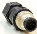
For GbE UTP (A-code model)