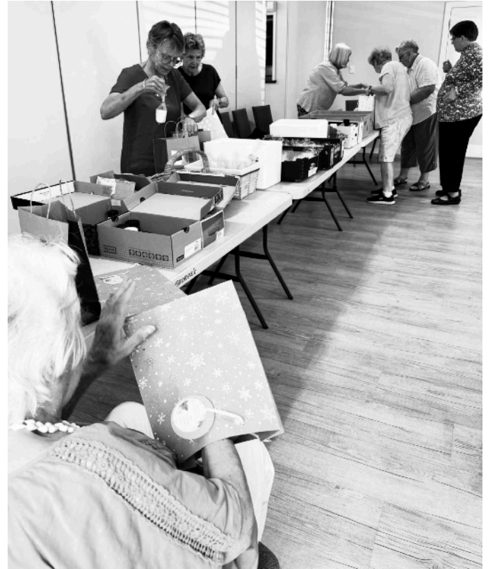
Collating Christmas Bags ready for distribution

In March we hosted The World day of Prayer Service at St George's. In addition, most of the ladies were heavily engaged with our annual Fete, held on the 7th March. On the 19th March we attended a combined meeting, hosted by Busselton Branch, at The Anglican Campsite. Seven of our members attended and viewed the MU Caravan.