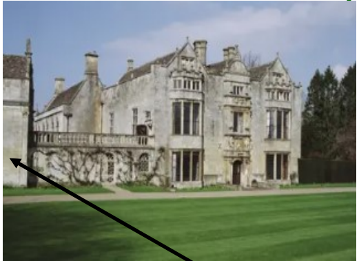
Burford Priory and Chapel - above

One of the things that I had to leave behind in England when we migrated to South Australia in 2003, was my being an Oblate of the mixed Benedictine Community (nuns and monks) who lived at Burford Priory in the Cotswolds. An Oblate is someone who has a particular association with a monastery or a convent and who follows a Rule of Life which seeks to incorporate the monastic spirit in their daily lives. One of the requirements of Oblature was to spend seven nights a year staying in the Community Guest House participating in the full worshipping life of the Community. I obviously had to let that go, as I couldn't make that commitment!