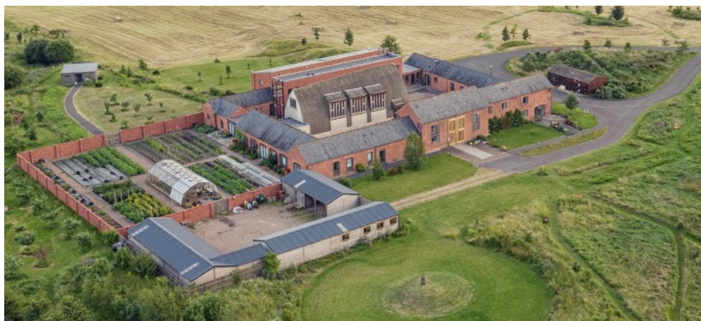
Mucknell Abbey - built 2008 in Worcestershire

Obviously, there have been changes in personnel over the intervening years, but there are still four of the Community there who I knew at Burford, and there are now seven new nuns and monks. What hasn't changed is the worshipping life and spirituality, and it was a real joy and privilege to enter into the silence, the prayerfulness and the life of the Community, and to step away from the hubbub of everyday life for a little while, and to reflect. (If you are interested in reading more about the Community, you can visit their website at https://mucknellabbey.org.uk/ )