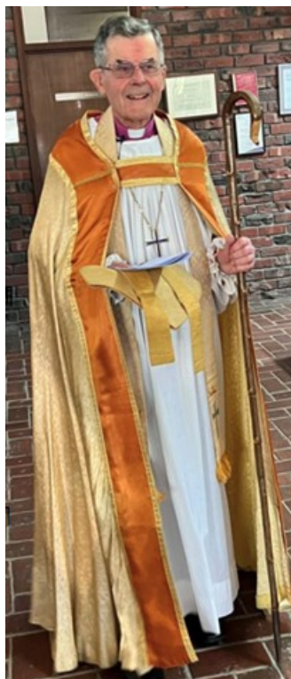
Bishop Keith pictured at St Saviour's in 2024