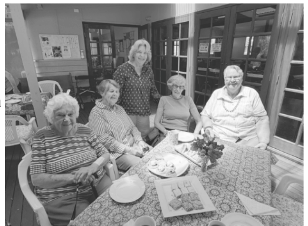
Some of the Dunsborough hosts

Our MU members bake up treats – sandwiches, slices and scones are required items each month. The morning tea is normally on the third Wednesday of the month, except during the winter. This also means that people visiting the Op Shop are able to be invited to join us. This ministry blesses many in our community.