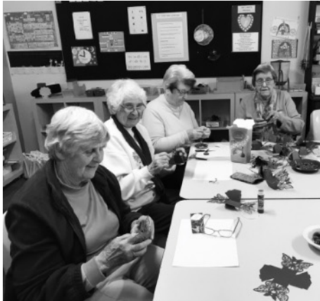
Making the butterfly boxes for the Rally lunch

Greetings from Mandurah Branch. A lot has happened in our neck of the woods since my last edition.. I need to keep it brief this time due to having so much news across the region.