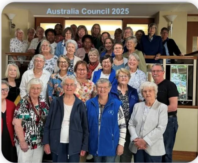
Australian Council 2025