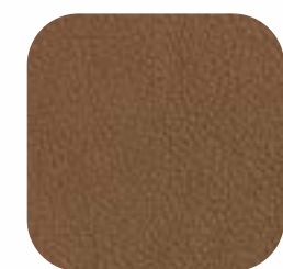
Couro Soft Sépia