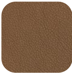
Couro Soft Sépia