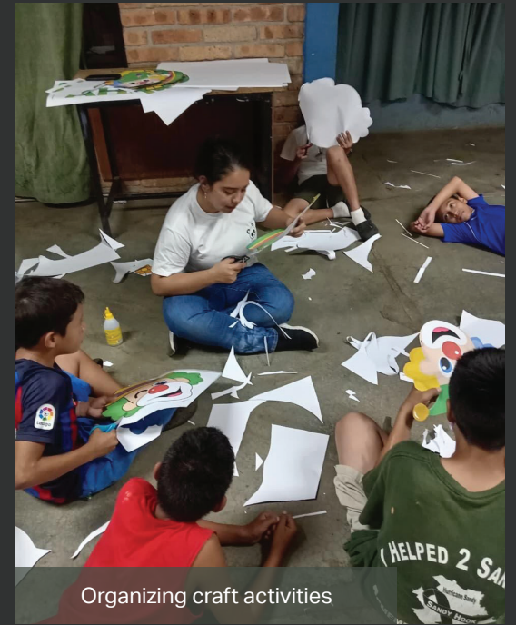
Organizing craft activities