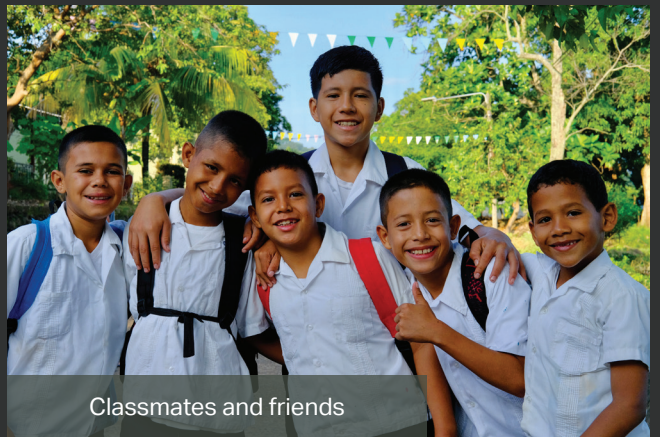
Classmates and friends