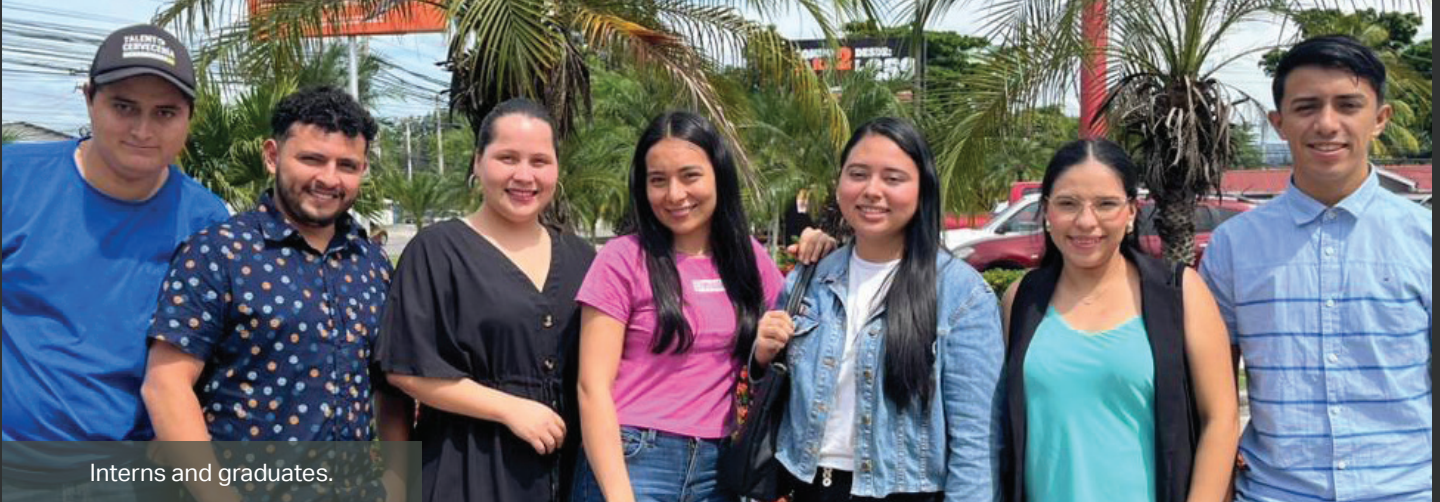
Interns and graduates.