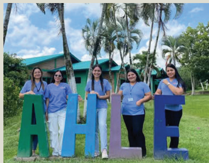
University students visit to lead workshops