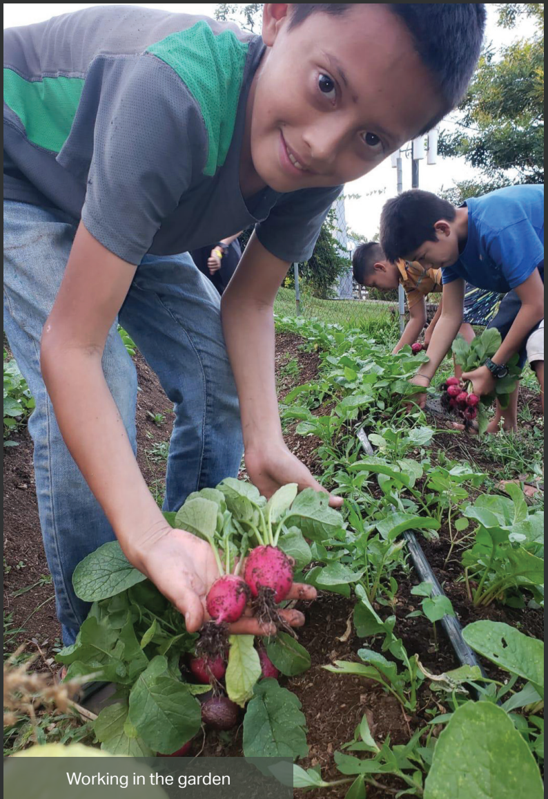
Working in the garden