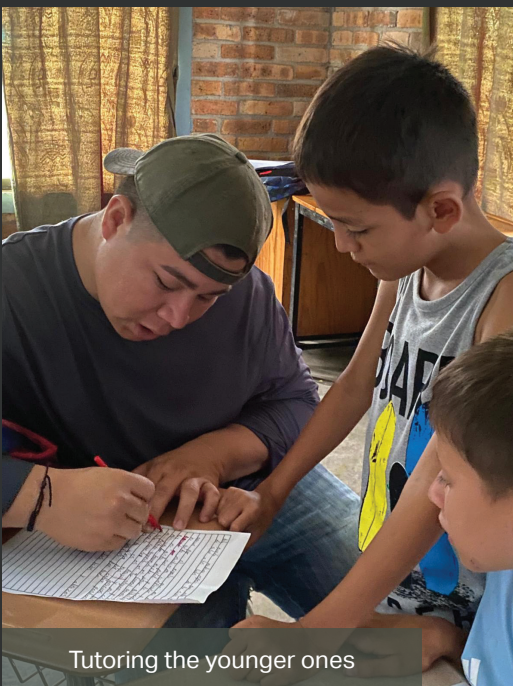
Tutoring the younger ones

Giving back to the Foundation that opened the door to their education, our Higher Education students dedicate hours to tutoring, organizing activities, and mentoring younger students at AHLE – showing them firsthand what is possible and inspiring the next generation to dream big.