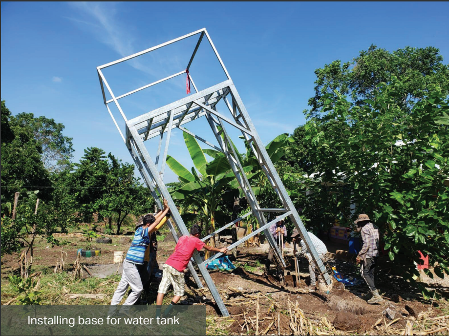
Installing base for water tank