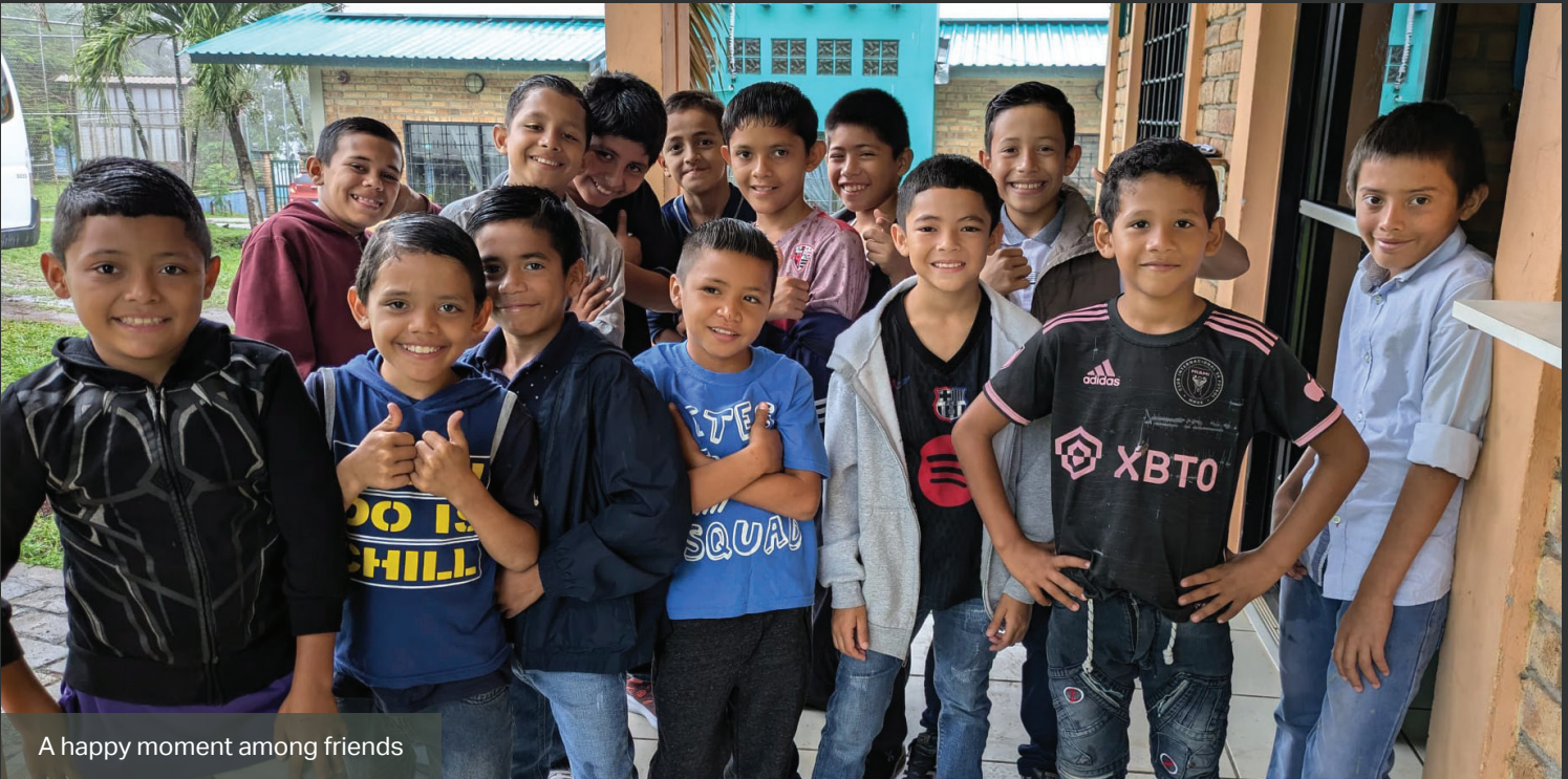
A happy moment among friends