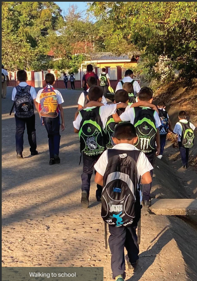
Walking to school