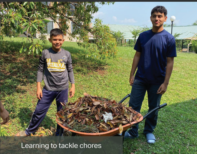
Learning to tackle chores