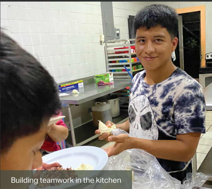
Building teamwork in the kitchen