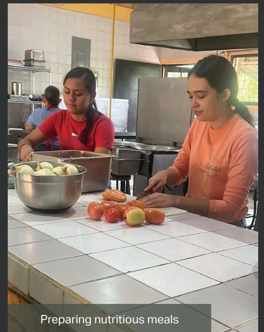
Preparing nutritious meals