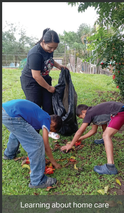
Learning about home care