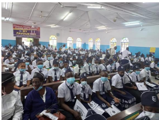
Over 400 girls enrolled. Mombasa

Greetings from GFS Kenya in Jesus name. It is my hope that the Lord has kept you safe under his arms despite the covid-19 pandemic. As a country, we bless the Lord for the breakthrough of having our girls enrolled this year. This is an event they had really looked forward to last year, but due to unavoidable circumstances, we had to postpone it. Girls between 5-17 years turned out in large numbers for the training sessions as they prepared for the enrolment. We give God all the glory and honour for seeing us through. Lots of activities have been going on in the Parishes since due to covid-19 protocols people are not allowed to congregate in large numbers. Let's continue praying for affected families especially members of the GFS. We love you and wish you God's Blessings.