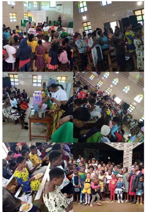
Holiday activities 1

May God bless the Gfs around the world and prosper the works of our hand for His glory and the benefit of mankind.