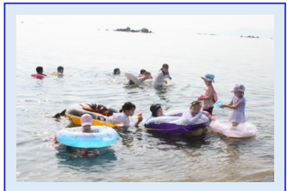
Boys and Girls playing happily in the sea

We spent a pleasant time and are grateful that our God watches over us.