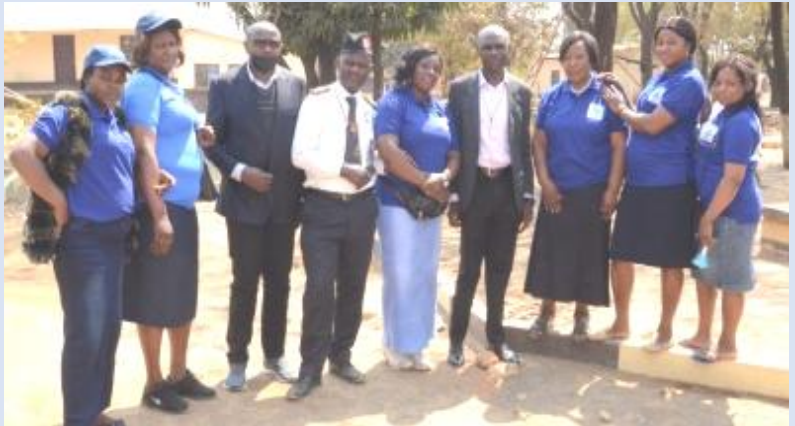
Retreat July 31 – Aug 1