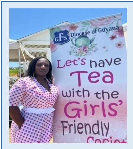
President - GFS Guyana

Unfortunately, Guyana reported its first case of Monkey Pox on the 22 nd August 2022. We pray for God's healing mercies to protect us.