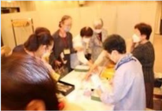
People holding handmade items of GFS Division

We had an opportunity to have a GFS booth at the General Meeting of the Japan Anglican Women's Association in June in Osaka. Due to the COVID-19 pandemic, we have faced difficult situations and have not been able to hold charity bazaars for a few years. So this time many people came to visit our booth. It meant a lot for us to have this opportunity