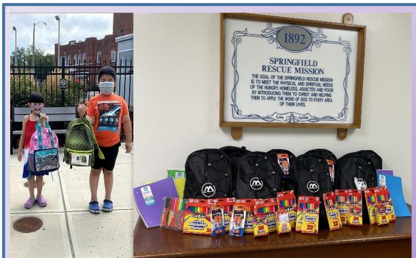
Donations made to Springfield Rescue Mission

The Fall marks the return to school for children in the United States.