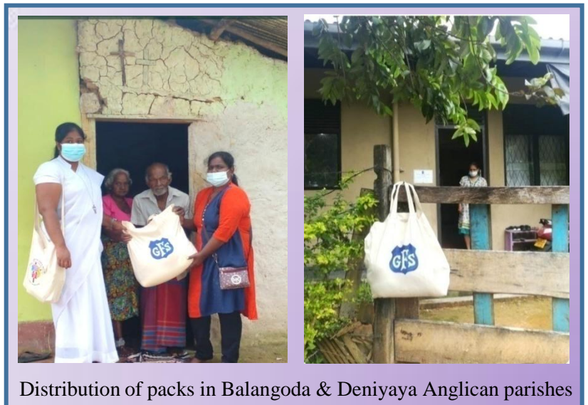
Distribution of packs in Balangoda & Deniyaya Anglican parishes

This continues to low income families of parishes in the beautiful central hill country region, the culture-rich southern province and other areas, according to the following criteria – women headed households, families infected by covid and in quarantine, families whose bread winners have lost their jobs and daily wage earners.