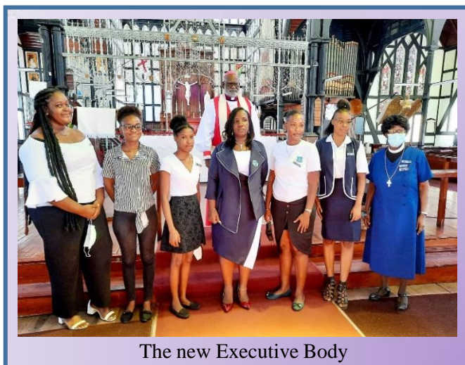
The new Executive Body

The Bishop's message was one of girls building relationships. He emphasised that relationships are built on trust. His hope for the GFS is that it will give young girls the tools to manoeuvre life as they grow older. He acknowledged that the GFS is a reputable organisation with over 100 years of experience.