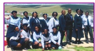
Revival at St. Francis Parish. 32 new members admitted