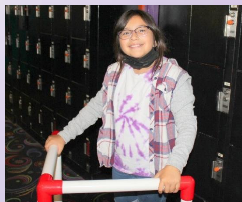
A new member learning to roller skate for the first time

GFS LA also continues to incorporate its social justice program into its calendar of activities. They hosted a presentation by a teenager who lives with cerebral palsy and is raising awareness for equal treatment of disabled persons, made tie-dyed pillow cases to give to a hospital and made a virtual visit to an animal sanctuary.