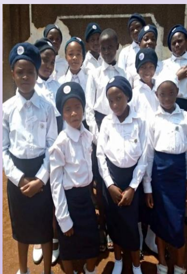
Newly Admitted Members/ Opening of Branch during Bishop's Episcopal Visit