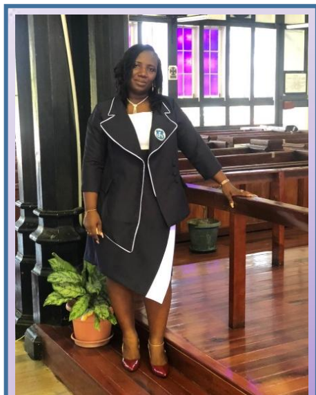
The new President