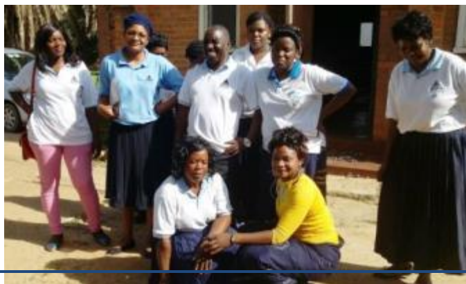
Some of the Executive members

The GFS – Zambia activities started this year by GFS members attending an All Church groups opening service that was held at St Peter's Anglican Church on 24 th January, 2015 followed by a National GFS Executive Committee Member's meeting in Kabwe at St George's Anglican Church.