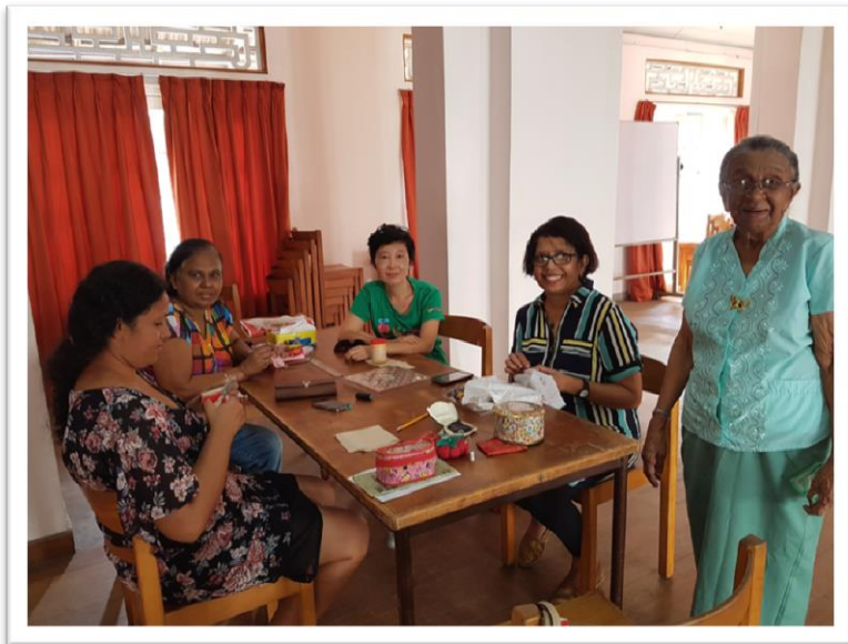
Craft Morning in GFS Hall

As my last overseas visit as World President it was like all the others, so full of friendship and action, such a strong commitment to GFS and all it means to us.