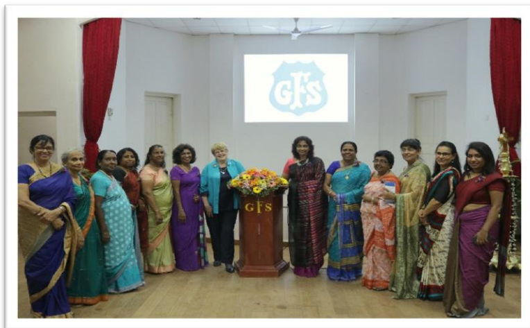
GFS Sri Lanka Executive Council with GFS World President