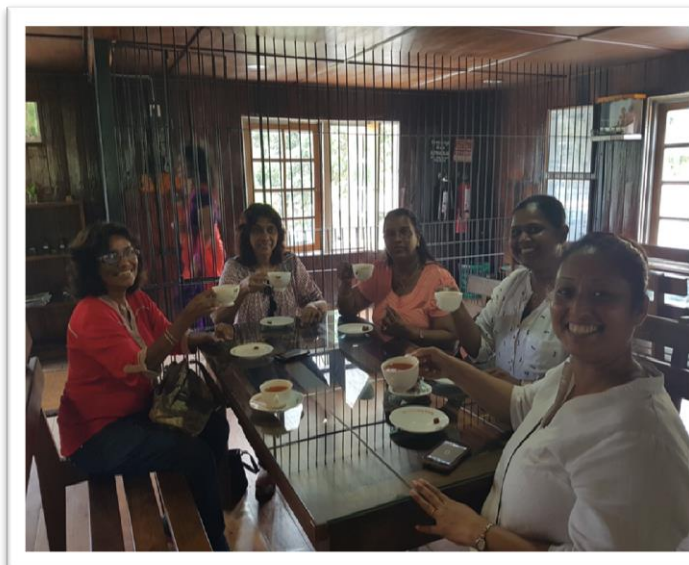
Drinking Ceylon Tea together on our day out to Kandy