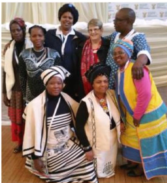
National Dress at Youth Conference