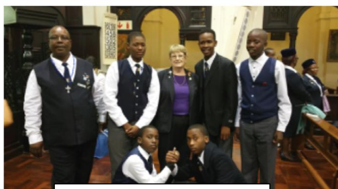
Boys Friendly Society members

One of my greatest impressions was the growth of GBFS. I congratulate South Africa and some other African countries for incorporating boys into GFS. In a time when they are battling gender issues, particularly violence it is a very positive step to involve boys and girls together and I am sure it will reap many benefits. I am very sure that GFS