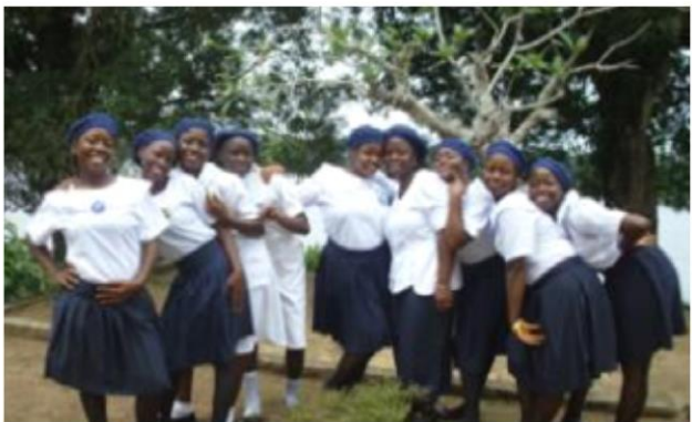
Bromley Episcopal Mission GFS

St. Thomas CJR – GFS: Has two new instructors for sewing lessons. The girls now have a basic idea about the parts of the sewing machine. They have completed peddling, cutting and measurement taking. Their focus is now on sewing. Baking classes have commenced but on a slower pace. Praise dance practices are ongoing. Their girls are eager to learn. Currently, most of their time and resources are invested in preparation for their annual program slated for July 24th.