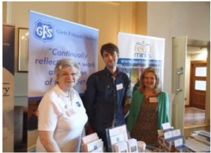
Sharing a stand with 'Feed the minds' at General Synod