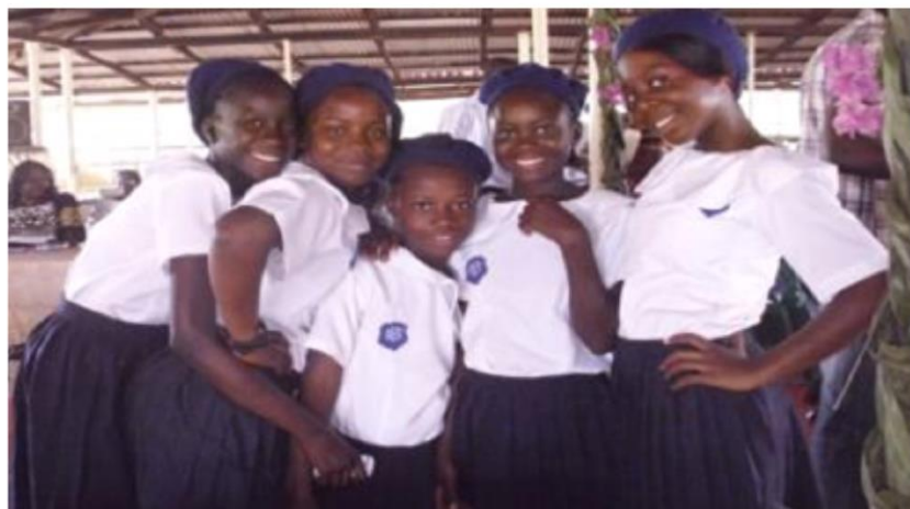
St. Peter Episcopal Church GFS