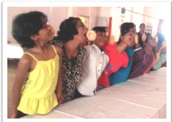
The bun eating competition in full swing at the Avurudhu Games

Easter Celebration and Avurudhu Games held on April 2 - A short service followed by "Make the bunny" group competition, traditional games, refreshments, baila (dance) competition, awarding prizes. Please visit our FB Pages to enjoy the pictures.