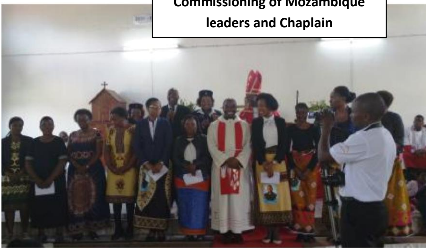
Commissioning of Mozambique leaders and Chaplain

I have come home renewed and reinvigorated and now look forward to my visit in two week's time to the USA and Canada.