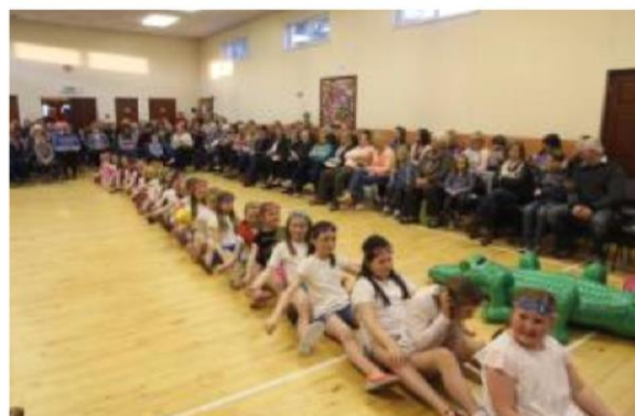
The boat dance at Parent's night.