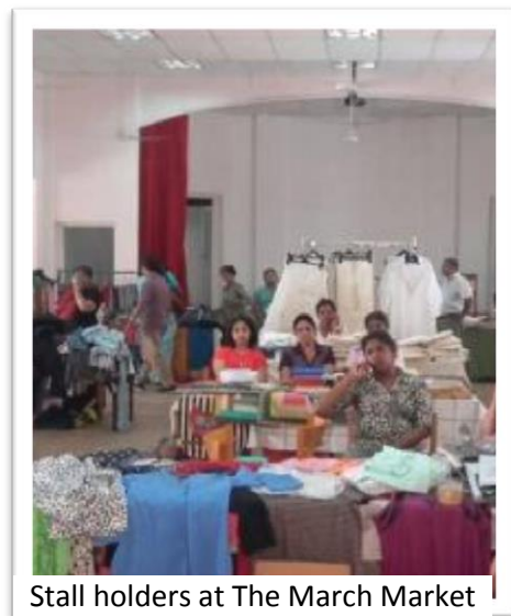
Stall holders at The March Market 2016