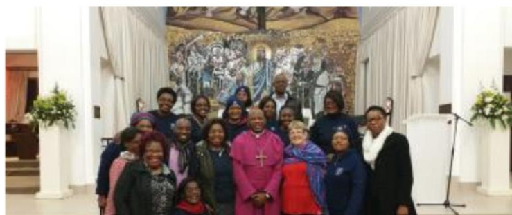
Bishop of Johannesburg after the Opening Service of the Youth Conference