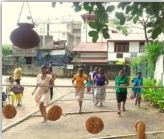
Avurudhu fun - See how they run! The bun eating race begins. Also note the pot hanging above.