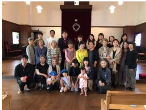
Kobe, Osaka, Kyoto GFS members at St. Michael Church

GFS Kobe, Kyoto, and Osaka got together at the Cathedral of Church of St. Michael in Kobe on 1 st Oct. for the GFS World Prayer Service. They had a good time with tea and yummy cakes. After that they enjoyed handicraft. The biggest grace is that very young members have participated. They wore GFS berets which were given by their mother and aunt. They used to wear the berets about 25 years before. It is so great to know that GFS has continued for a long time.