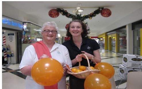
GFS Australia giving away oranges and having conversations with people in the mall.

and useful creations. This could be compared to the way God transforms us