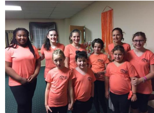
GFS USA took part in the fight against women and children abuse with their Orange Colour