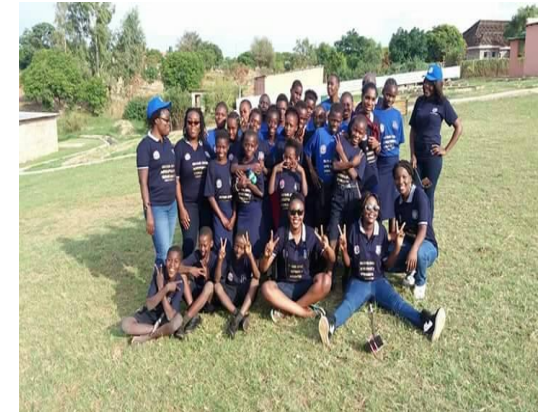
GFS Zambia had a national camp where we had different activities, the most highlighted one being Ms GFS Zambia