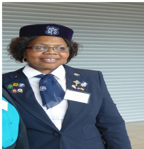
From the World President

(A ministry of the Anglican Church) Gal 6:2 - Bear one another's burdens, and in this way you will fulfill the law of Christ