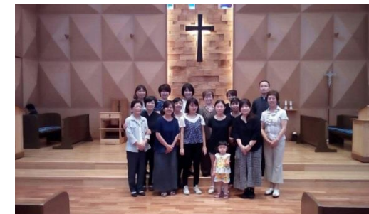
Okinawa GFS members at the new church.