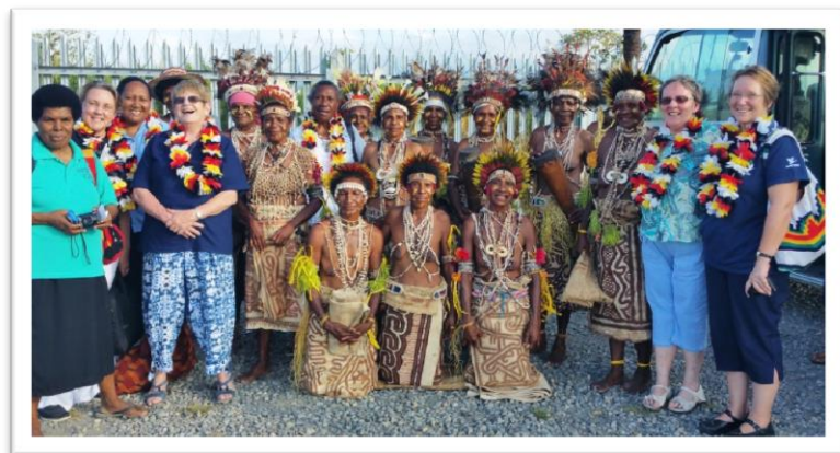
Arriving at Popondetta Airport