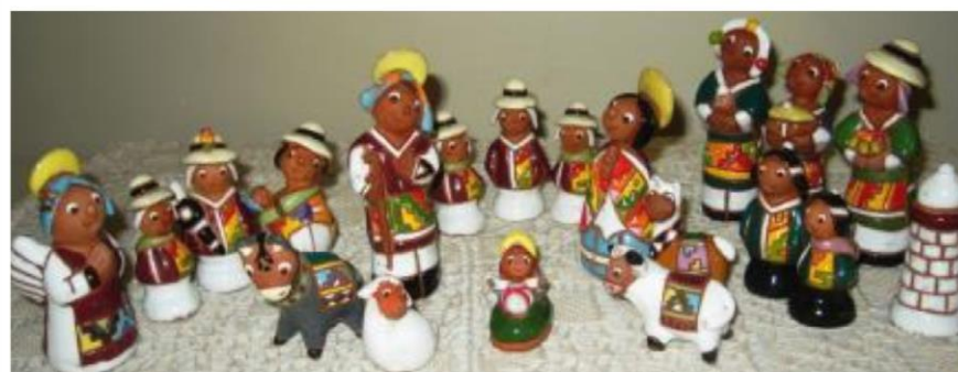
Nativity Scene from Bolivia