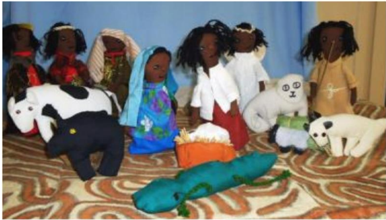
Nativity scene from Papua New Guinea

We have now entered into the Season of Advent and this season as we all know points us to look ahead with expectation and in preparation like those of the first Christmas to the coming of the birth of Jesus Christ –