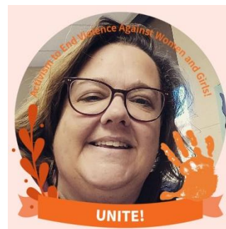
UNCSW Colleague King George County, Virginia