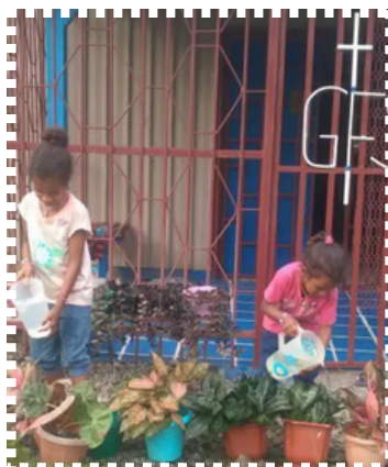
GFS GIRLS WATERING PLANTS AT GFS HAUS ORO.