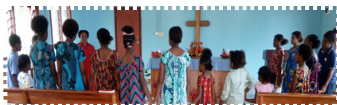
GFS MOTHER CHAPLAIN PRAYING OVER SUNDAY SCHOOL CHILDREN.