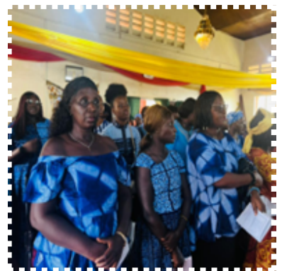
FUND RAISING COMPETITION FOR THE BAKERY AND TAILORING PROJECT.