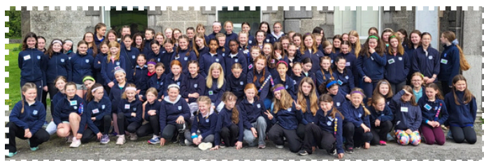
GFS IRELAND PICTURED AT DREWSTOWN HOUSE ON THE FINAL DAY OF ALL - IRELAND CAMP 2025 "FRIENDSHIPS - BONDS THAT LAST".