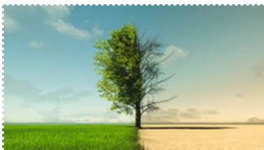
UN Sustainable Development Goal 13