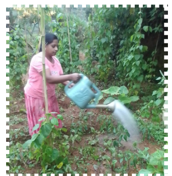
HOME GARDENING PROJECT.