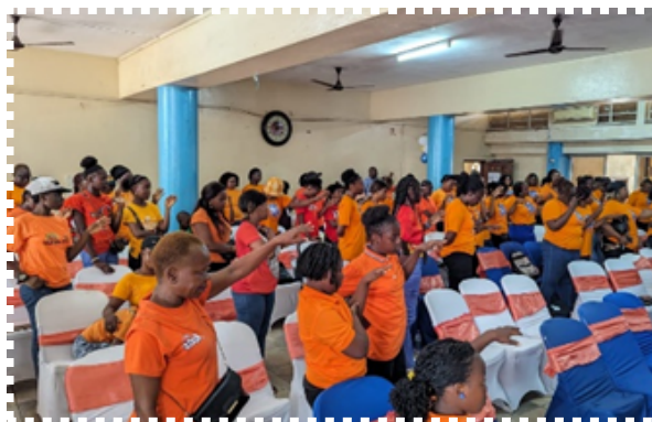
LAUNCHING OF ORANGE DAY.