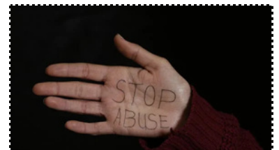
UN Sustainable Development Goal 5