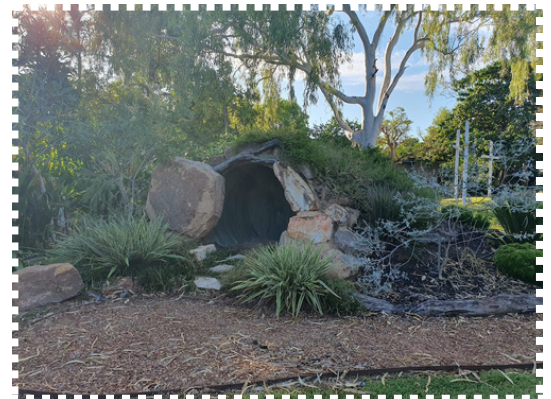
NORTHERN TERRITORY – FROM THE MINISTRY TRAINING COLLEGE NUNGALINYA, WHERE THE STATIONS OF THE CROSS HAVE BEEN USED TO INSPIRE GARDENS, AN IMPORTANT ASPECT OF INDIGENOUS LIFE. THIS ONE DEPICTS THE EMPTY TOMB.