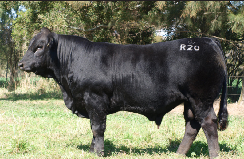
FLEMINGTON READY TO ROLL - FPFR20