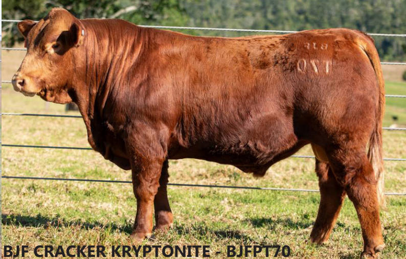
BJF CRACKER KRYPTONITE - BJFPT70