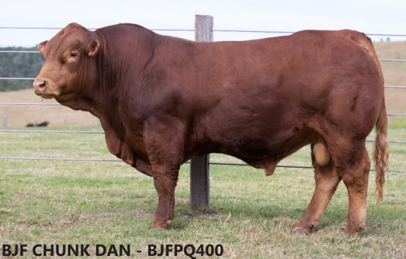
BJF CHUNK DAN - BJFPQ400