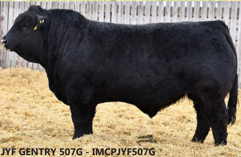
JYF GENTRY 507G - IMCPJYF507G