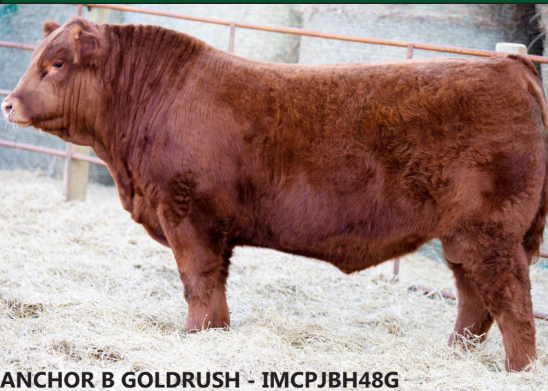
ANCHOR B GOLDRUSH - IMCPJBH48G