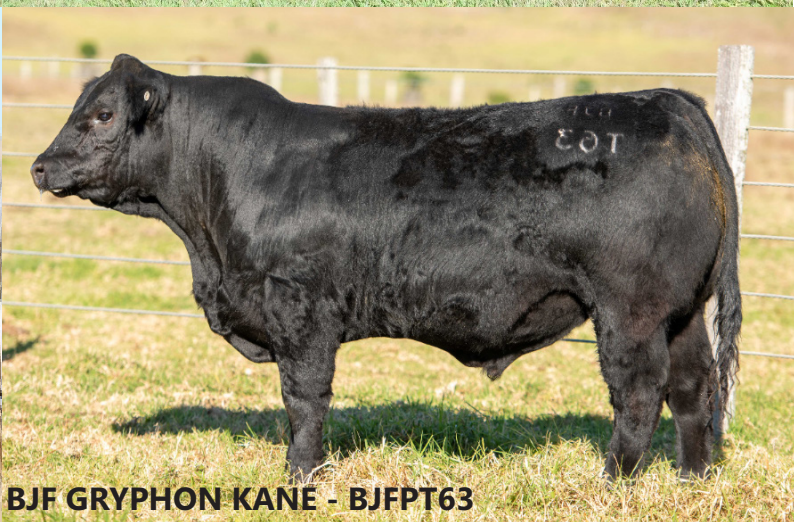
BJF GRYPHON KANE - BJFPT63