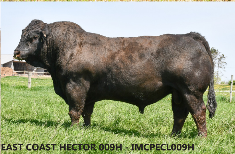
EAST COAST HECTOR 009H - IMCPECL009H