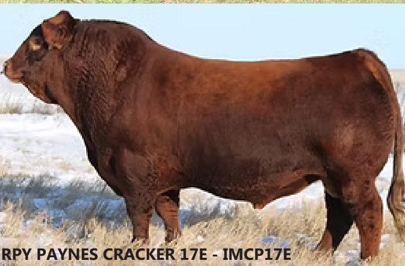
RPY PAYNES CRACKER 17E - IMCP17E