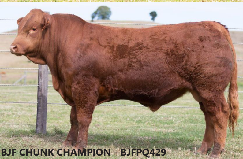
BJF CHUNK CHAMPION - BJFPQ429