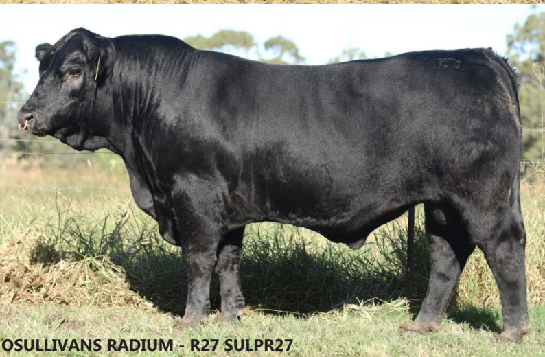
OSULLIVANS RADIUM - R27 SULPR27