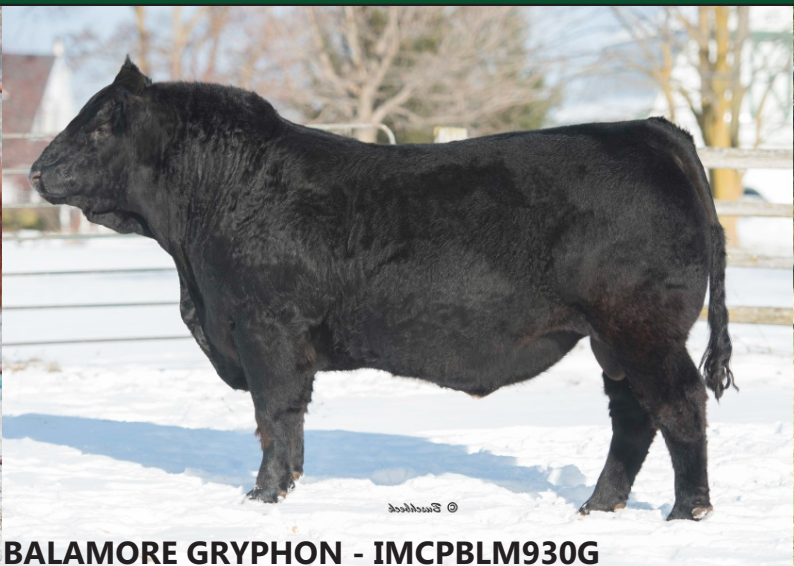
BALAMORE GRYPHON - IMCPBLM930G