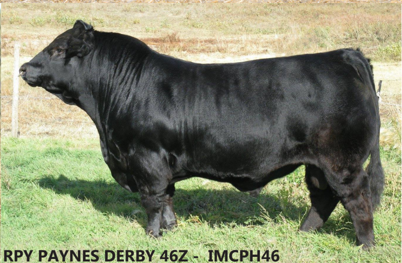
RPY PAYNES DERBY 46Z - IMCPH46