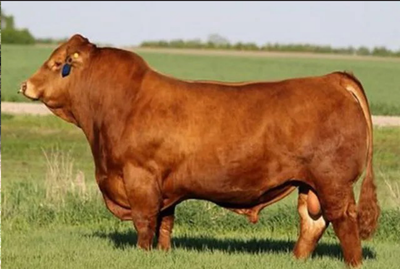
JYF CHUNK 35C - IMCPC35