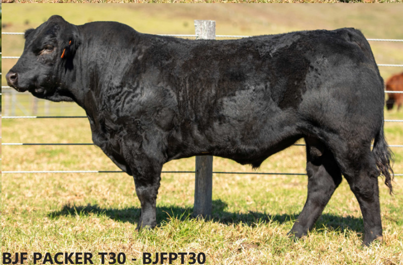
BJF PACKER T30 - BJFPT30