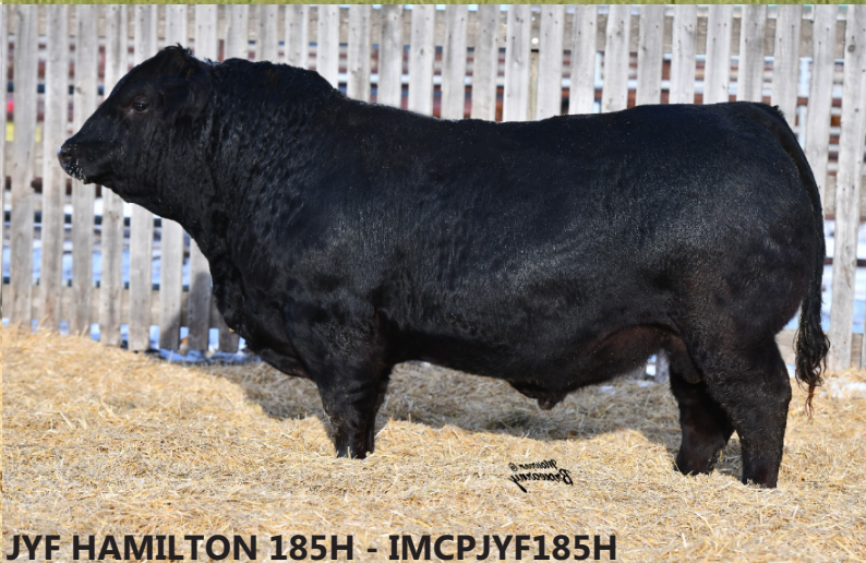
JYF HAMILTON 185H - IMCPJYF185H