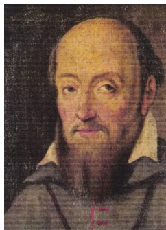
St. Francis de Sales, 1567-1622 Bishop, Doctor of the Church, Founder

This spirituality is a practical, intentional way of living a devout life by doing all through love and nothing through force. Salesian Spirituality teaches us to engage in heart-to-heart relationships with God and others. It encourages us to embrace fully the present moment and to not look forward to the future with anxiety but to place the future in God’s loving providence.