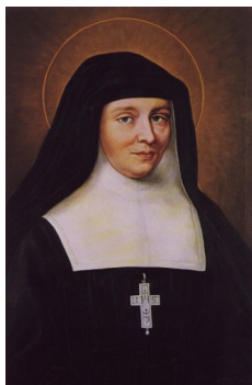
St. Jane de Chantal, 1572-1641 Founder