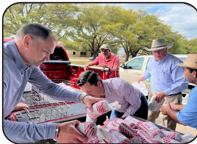
Delivering to the Salvation Army and Feed My Sheep, with members of the Buyer's Group