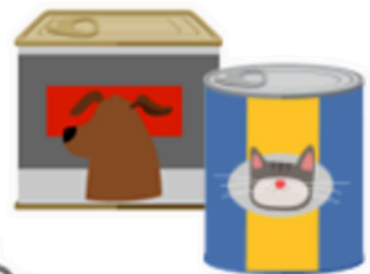
Canned Pet Food