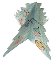
Different angles of completed tree.