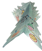
Different angles of completed tree.