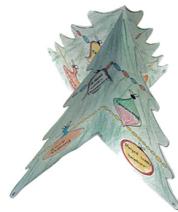
Different angles of completed tree.