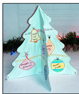
Weeks 1 & 2 together.