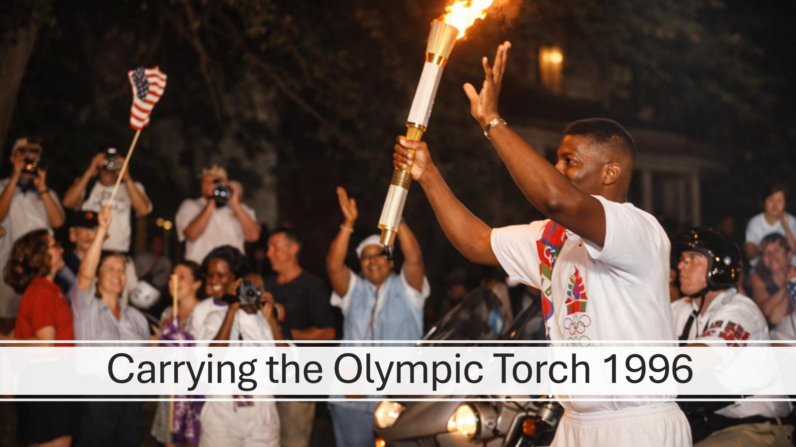
Carrying the Olympic Torch 1996