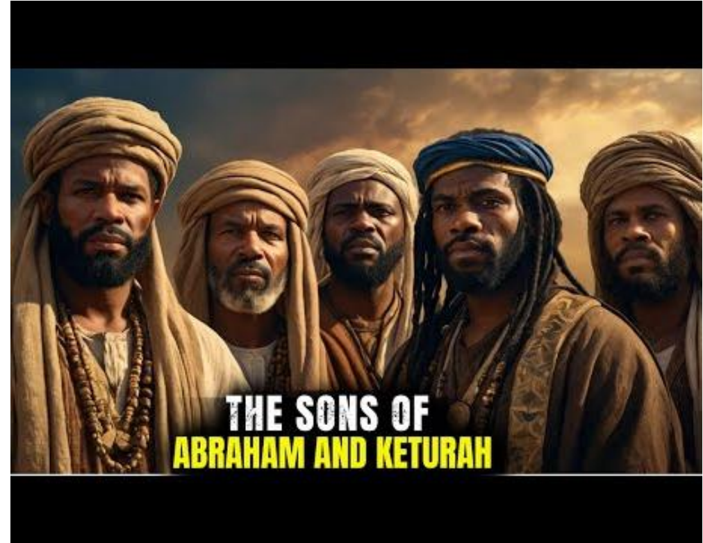
Abraham, Keturah and Their sons