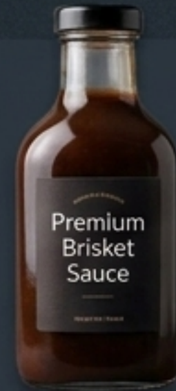
Premium Brisket Sauce