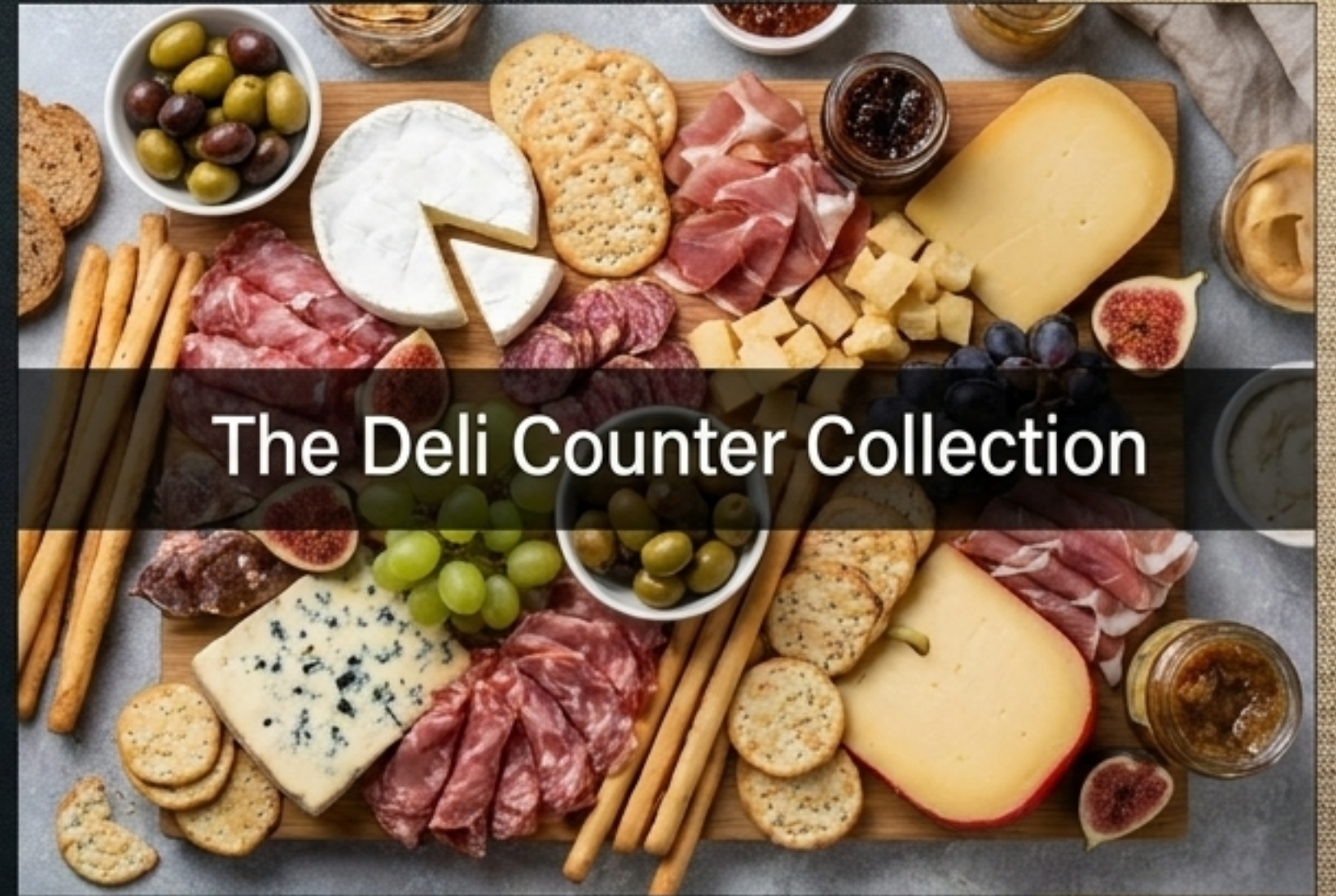
The Deli Counter Collection

Synthesizing a massive institutional catalog into targeted retail solutions.