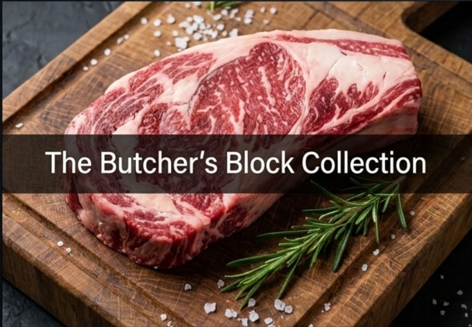
The Butcher's Block Collection