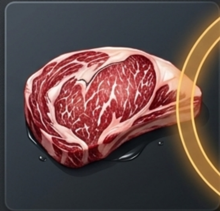
Primary Premium Item (e.g., $100 Wagyu)