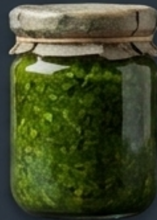
Fresh Chimichurri (herb-rich)