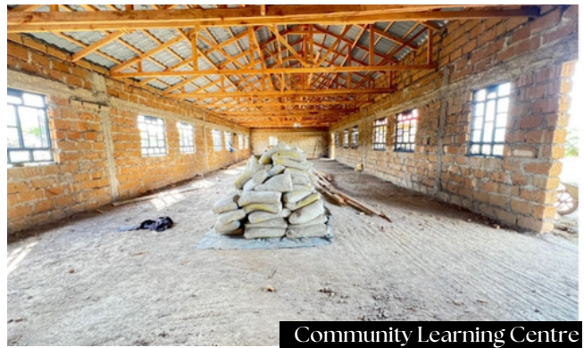
Community Learning Centre