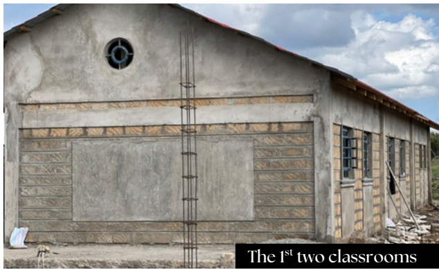
The 1 st two classrooms