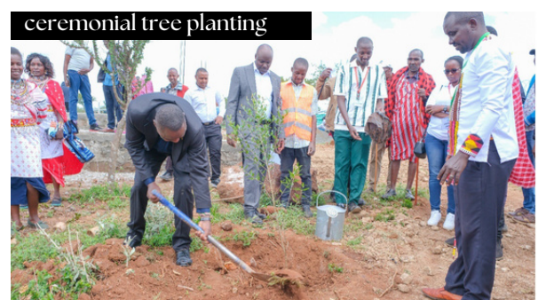
ceremonial tree planting