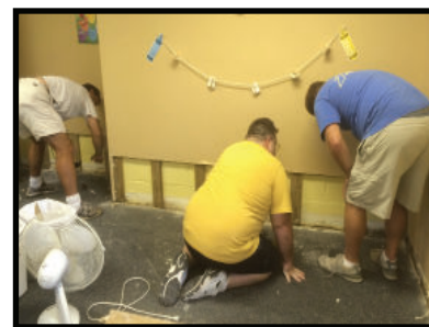
Repairs at St. Paul's Anglican Church in Conway, South Carolina.

The men from St. Paul's Anglican Church in Conway were there to help.