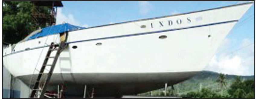
The Ixdos mission ship is under construction in Watsonville, California.

ministry chapter at All Saints and in the Watsonville Rotary Club, which helped him get in touch with UNICEF Fund), which wholeheartedly supports the plan.