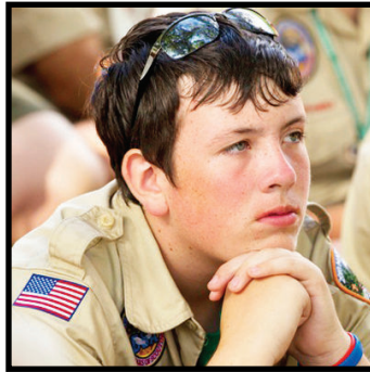
A Scout listens to a homily during an Episcopal service at the 2010 Boy Scout Jamboree at Fort A.P. Jill in Virginia.

At the 2010 Boy Scouts of America National Jubilee, 3.5 percent of the Scouts identified themselves as Episcopalians, but this number is also actually too small. That's because the Scouts often identified themselves by their schools - many of which are Episcopal schools.