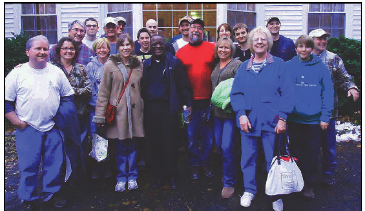
Men who organized a search-and-rescue organization, right, gathered volunteers to help unload supplies at St. Mary's by the Sea in Point Pleasant, New Jersey after Hurricane Sandy.