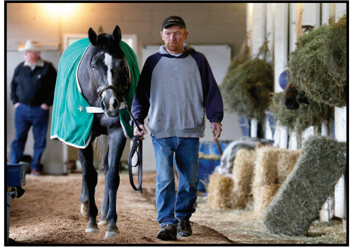
Hotwalkers and other backstretch workers are ministered to by Brothers from St. Francis in the Fields Episcopal Church in Louisville.

They also cook dinner and sometimes serenade the Ladies Bible Study Class.