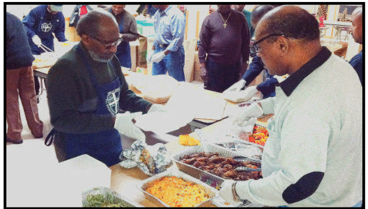
Brooklyn men conducted an annual dinner and toy drive Dec. 21, 2013 at the Women In Need Family Shelter. More than 300 meals were served to the shelter's residents and more than 100 toys and school supplies were distributed.

Residents chose from a wide variety of clothes, coats, shoes and boots donated by men from the churches.