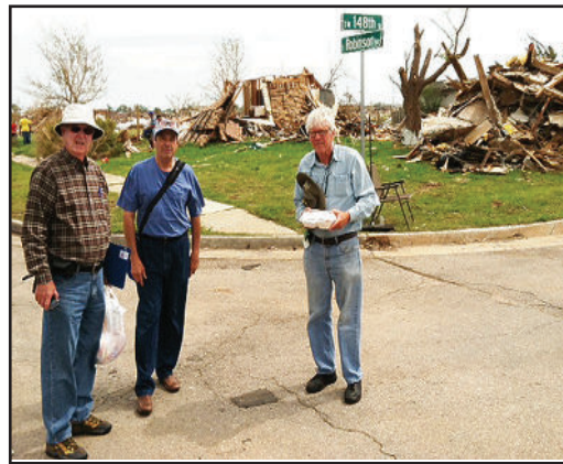
Tulsa Episcopalians in tornado-ravaged Oklahoma.

"But when the tornado hit Moore, food-and-water wasn't as much of an issue; they just needed manual labor to