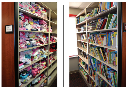
Books and clothing are made available in the office for patients.