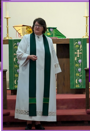
First Day in Sanctuary