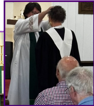
First Birthday Prayer