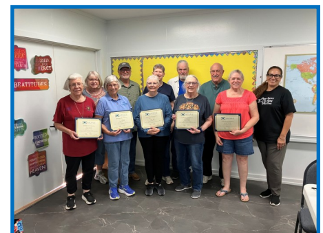
Balance Class Graduates Can get up when they fall!