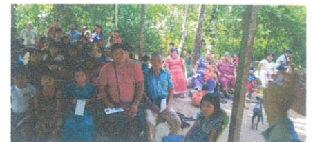
We were able to visit some pastors in the tribal areas.

Along the way we enjoyed beautiful vistas, Panamanian cuisine and very friendly people. Thank you for your prayers for our safety.