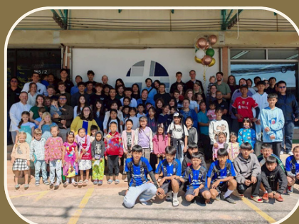
CELEBRATING 10 YEARS WITH OUR CHURCH!